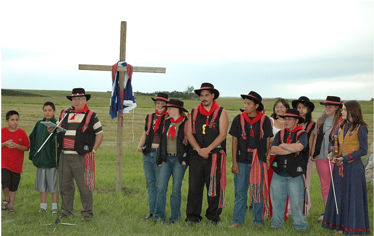
Métis Youth Representatives