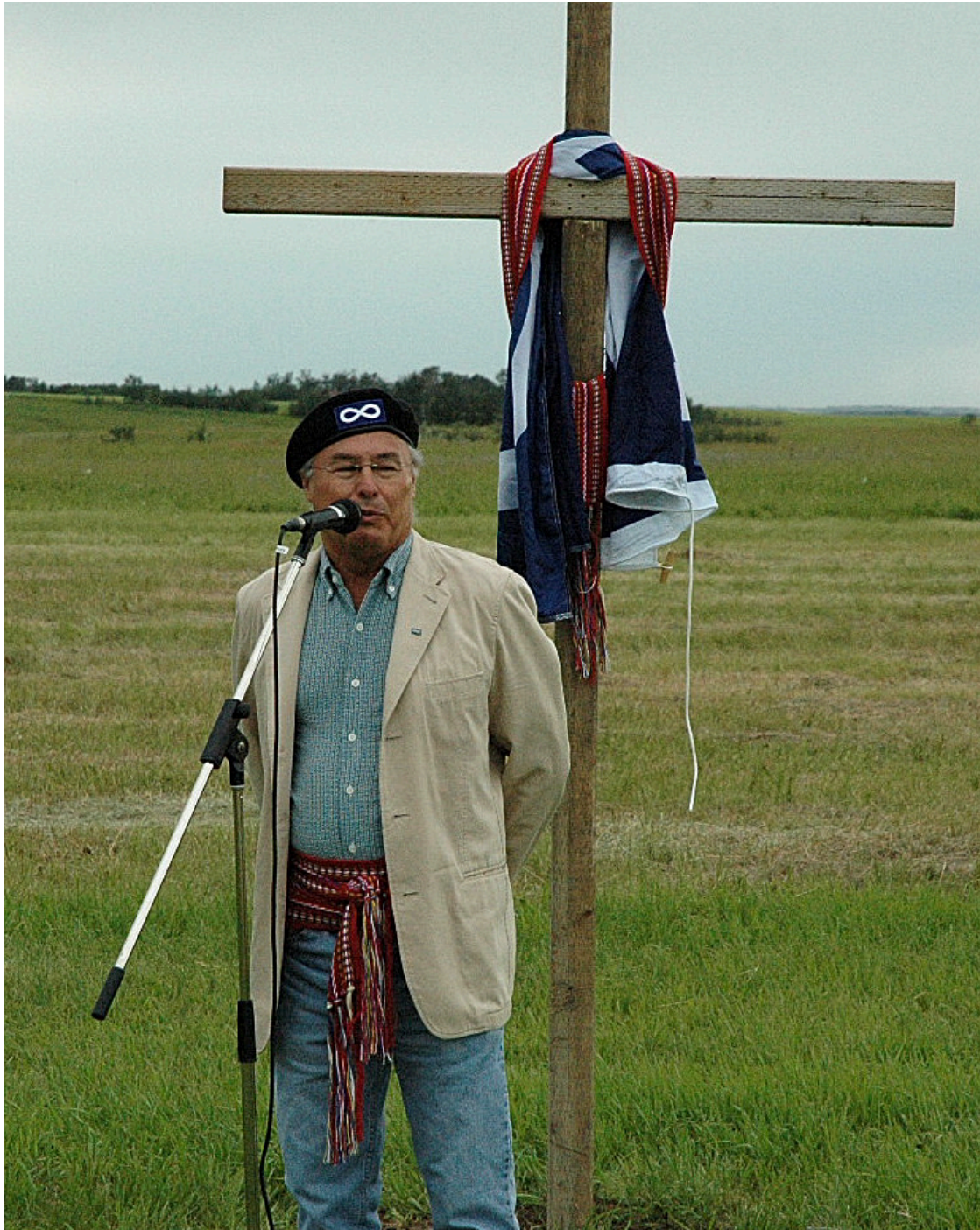
Métis National Council President Clément Chartier